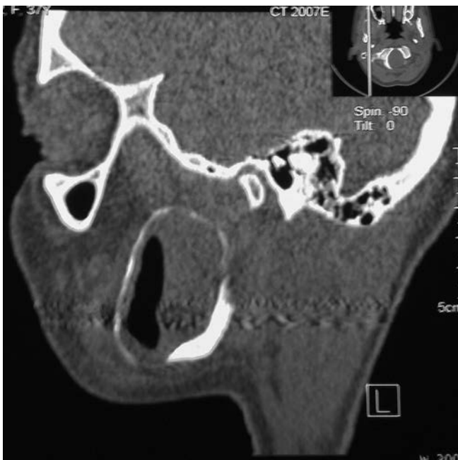
Figure 2 - Computerized tomography shows a hypodense image, located on the right side of the mandible, extending to the angle and ramus, reaching the coronoid process

Due to the large extension of the lesion, a more conservative treatment was proposed to the patient, preserving the important structures such as the inferior alveolar vascular-nervous bundle and integrity of the mandible basis. In November 2009, the patient was referred to the School of Dentistry of the "Universidade Paulista de Goiânia", to have an incisional biopsy and lesion decompression.