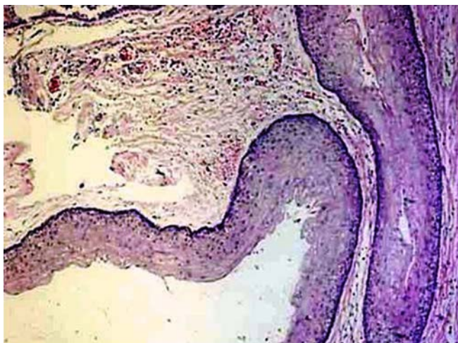
Figure 4 - In histopathological analysis was possible to observe the presence of cystic capsule lined by stratified squamous epithelium parakeratinized, showing the basal cell layer arranged in palisades