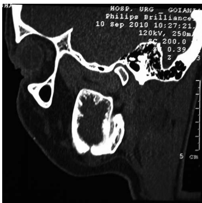
Figure 6 - Computed tomography revealed decreased injury and considerable growth in bone thickness