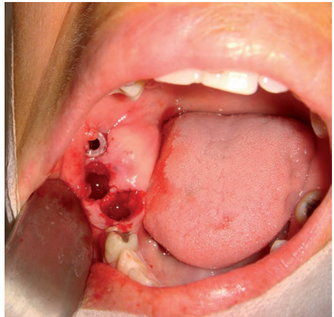
Figure 3 - Trans-surgical Stage. Part of the bone cavity roof was removed, providing communication with the oral cavity in the region corresponding to the eruption site of the second molar. Implant of a rigid circular drain for the purpose of maintaining the area opened and allowing cleaning. Extraction sites of first and second lower molars

The surgical procedure was initially carried out with an aspiration to rule out possible intraosseous vascular lesion. It was performed an incisional biopsy on the right posterior mandible region. Part of the bone cavity roof was removed, providing communication with the oral cavity in the region corresponding to the eruption site of the second molar. In the space created by the removal of biopsy tissue a hard drain made of anesthetic plastic tube for dental use (without rubber diaphragm and plunger) was installed. This drain was placed in order to keep the region open and allow the cleaning of the cavity by repeated irrigation with saline solution at 0.9%. After 30 days, the extractions of teeth 47 and 48 were performed, as they were without bone support (figure 3).