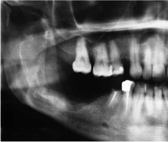
Figure 7 - Radiographic examination after three months of the surgical approach