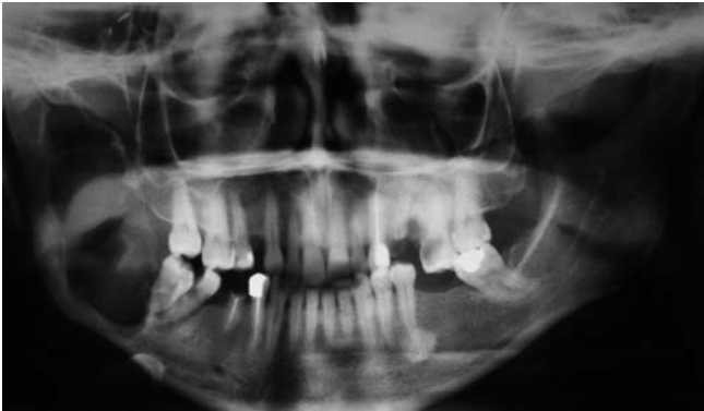
Figure 1 - Initial imaging aspect of the lesion. Panoramic radiography: one notes the presence of a multilocular, radiolucent image, located on the right side of the mandible in the region of the body and ramus

the angle and ramus, and reaching the coronoid process (figures 1 and 2).