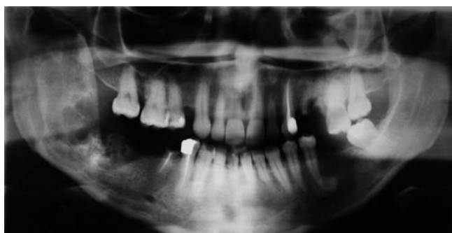
Figure 5 - Radiographic examination ten months after the beginning of decompression

At present, the patient is still being followed-up, and about 3 months after the treatment, radiographic images have shown that the areas previously affected by the lesion have undergone bone regeneration, including visualization of the alveolar inferior canal. The referred nerve was preserved and the patient presented normal sensitivity in the lower lip on the surgery side (figures 7 and 8).