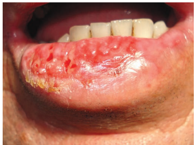
Figure 1 - Clinical aspect of lip epidermoid carcinoma: fissured, red lesion with yellow crusts

Even with the two aforementioned biopsy reports, we executed a new incisional biopsy at that first appointment (figure 2). The surgical piece was referred to the Service of Oral Pathology of UNIFEB. Histopathologic analysis was well-differentiated acantholytic squamous cell carcinoma. The patient was immediately referred to the Cancer Hospital of Barretos, Sao Paulo. The tumor clinical staging was T 1 N 0 M 0 . The patient's lower teeth were extracted due to medical instructions. The treatment comprised 20 radiotherapy appointments, at every 10 days (figure 3). Three months after the radiotherapy, the patient showed the following side-effects: disfagia, loss of taste, smell and xerostomia. The lip exhibited an ulcerated aspect and the chin showed radiodermatitis (figure 4). Twelve months after the diagnosis, the patient still presented mild radiodermatitis, lack of beard on the chin, cicatricial fibrosis and the recovering oral mucosa (figure 5). Patient will be annually followed-up by the Dentistry Department of The Cancer Hospital of Barretos.