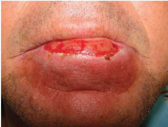
Figure 4 - Healing pattern aspect of the lip lesion. Observe the ulcerated mucosa and the chin's radiodermatitis