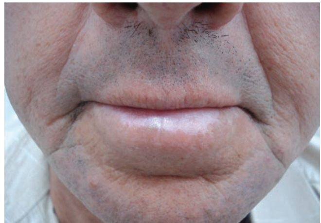
Figure 5 - Lower lip healing after the squamous cell carcinoma