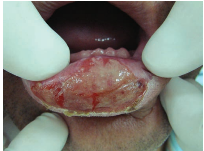
Figure 3 - Lesion's aspect after 20 radiotherapy appointments. Observe the absence of the lower teeth