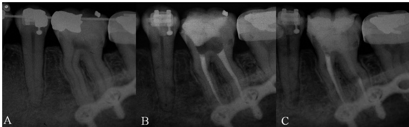
Figure 1 - (A) Initial radiograph showing the impossibility of visualization of the apex due to the presence of a mandible retaining plate. (B) Radiograph performed after endodontic treatment, in which the working length determination was performed by using the electronic apex locator. (C) Final radiograph after restoration procedures