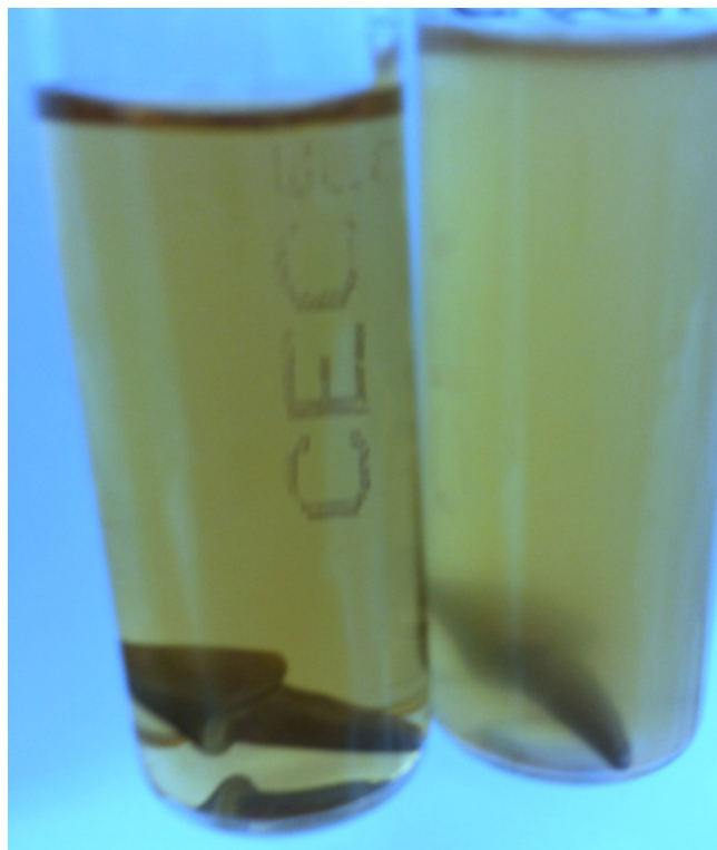
Figure 3 - After 48 hours of incubation, it was found that G1, G2, G3, G4, G5, G6 groups showed no clouding and the G7 presented turbid, indicating contamination

Cultures of bacteria present in the control group were performed on blood agar and lasted for 48 hours of incubation (figure 4). Catalase and coagulase testing was conducted in these colonies and the same was visualized in an optical microscope. It was determined through these tests that the bacterial species present in the control group was Staphylococcus sp. coagulase-negative. The visualization of the slides was performed with an optical microscope and observed, the entire arrangement in clusters (figure 5).