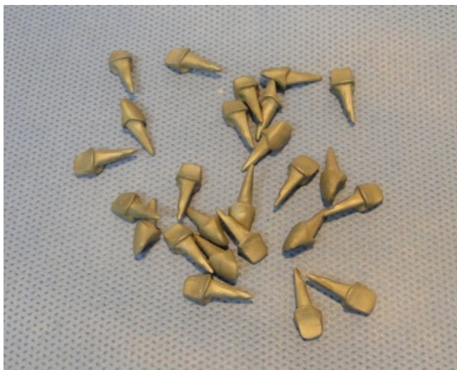
Figure 1 - Intracanal Metallic Post manufactured by CAD-CAM method and consequently with identical dimensions