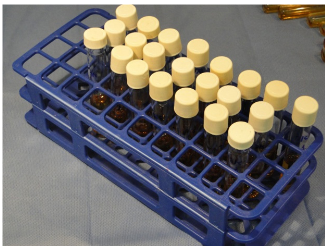
Figure 2 - All tubes containing the MFN immersed in BHI, at bacteriological incubator for 48 hours