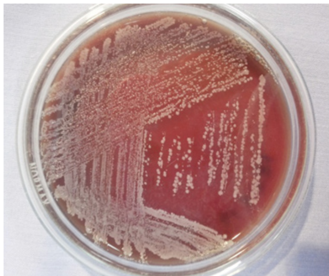
Figure 4 - Incubation on petri dishes