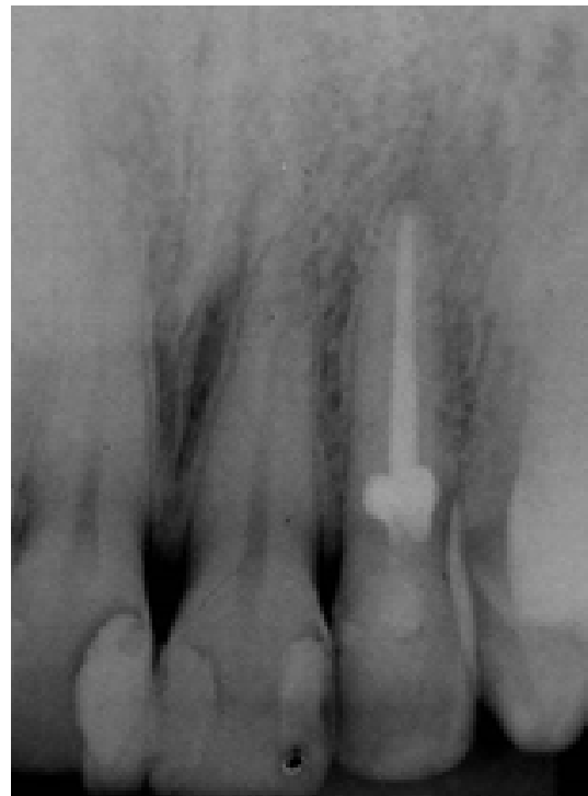
Figure 10 - 3-month following-up radiograph