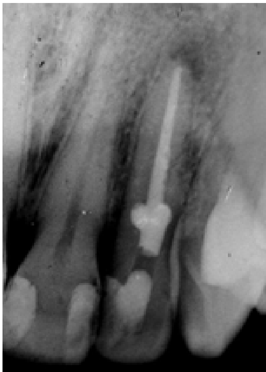
Figure 9 - Final distal radiograph