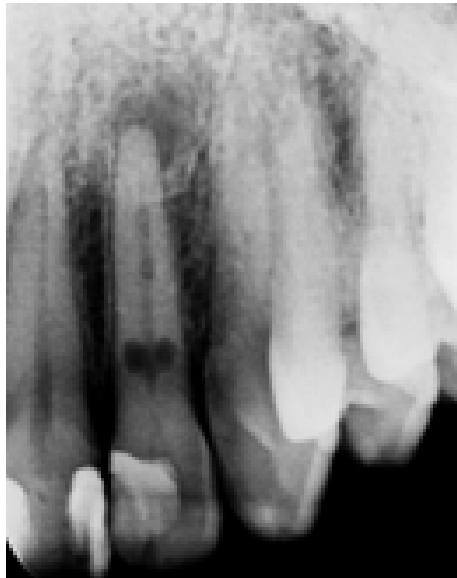
Figure 1 - Initial radiographic

Brazil), a intracanal dressing with calcium hydroxide powder. (Biodinâmica, Ipirorã, PR, Brazil) mixed with 0.9% saline solution (Fisiosol, Riberão Preto, SP, Brazil). The tooth was sealed with provisional material (Villevie, Joinville, SC, Brazil).