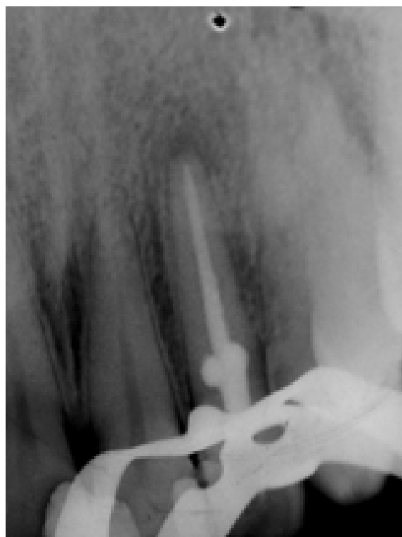
Figure 6 - Filling proof