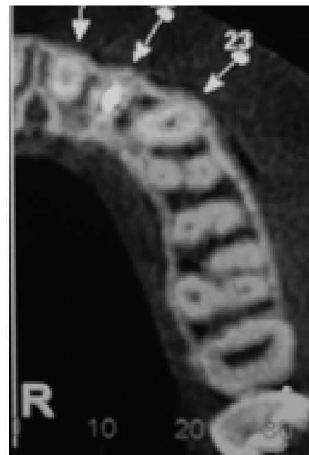
Figure 4 - Computed tomography