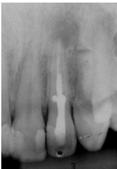
Figure 3 - Iodoform dressing

After 30 days, the intracanal dressing was changed for another obtaining by mixing calcium hydroxide powder and iodoform, and the tooth was radiographed (figure 3) and submitted to computed tomography (figure 4) to prove the diagnosis.