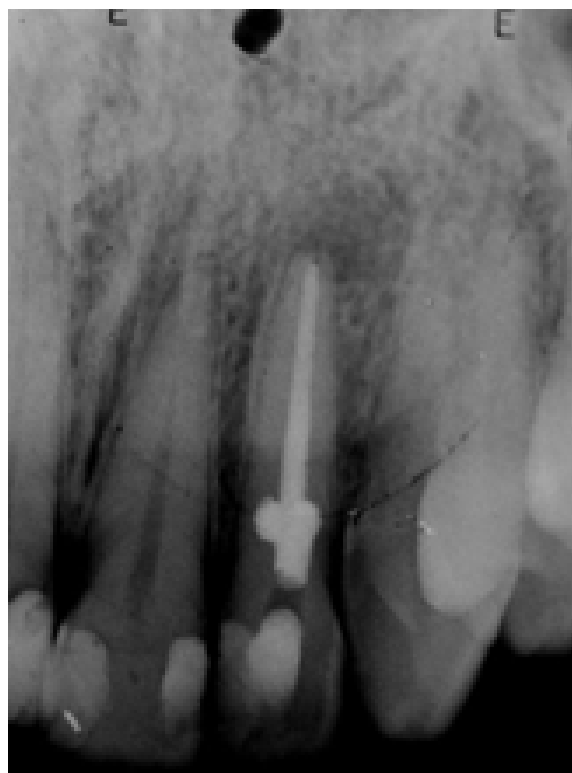
Figure 7 - Final ortho radiograph