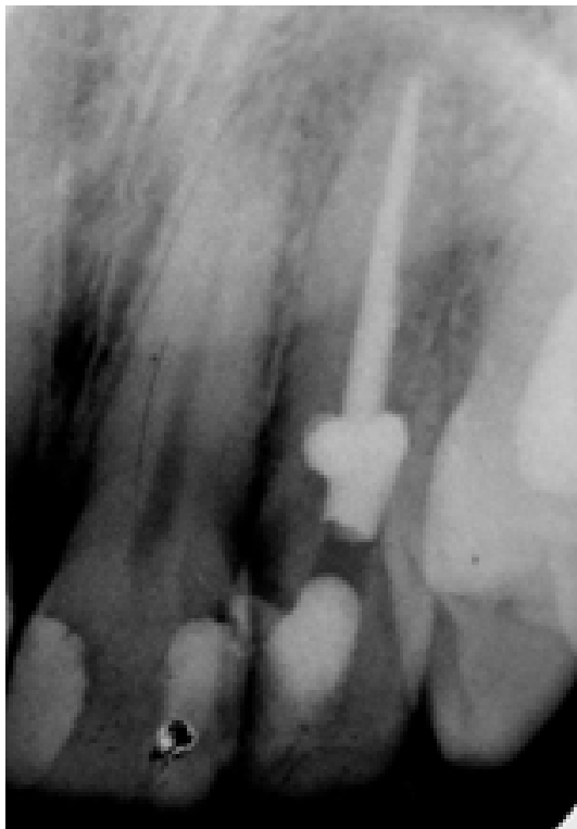
Figure 8 - Final mesial radiograph