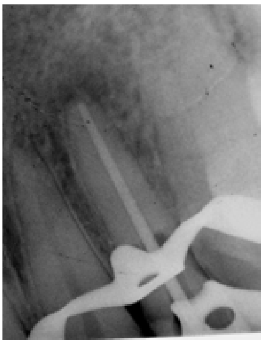
Figure 5 - Gutta-percha cone proof

Root canal filling was executed through Tagger's hybrid technique, which is based on the association of the lateral condensation technique with the thermo-mechanic compaction technique (Mc Spadden). The main cone #70 was used. To perform the visual, tactile, and radiographic tests (figure 5), two accessory points size MF was used in the lateral condensation technique together with the calcium-hydroxide-based endodontic sealer Sealer 26 (Dentsply, Petrópolis, RJ, Brazil) and gutta-percha compactor size #80 (figure 6). After the filling procedure the gutta-percha excesses were cut with the aid of heat hand instrument. Then the pulp chamber was cleaned with 70% ethylic alcohol, sealed provisionally, and submitted to the final radiographic (figures 7, 8 and 9). The patient was referred for final restoration. The patient was called after three months for radiographic control (figure 10) and did not present any signs or symptoms.