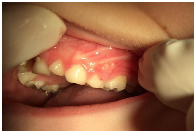
Figure 2 - Endodontic fistula of tooth #64

The tooth #64 showed endodontic fistula and deep large dentin carious lesion (figure 2), and thus extraction was indicated because of the impossibility of performing the radiographic examination due to noncompliance and impossibility to restore the tooth.