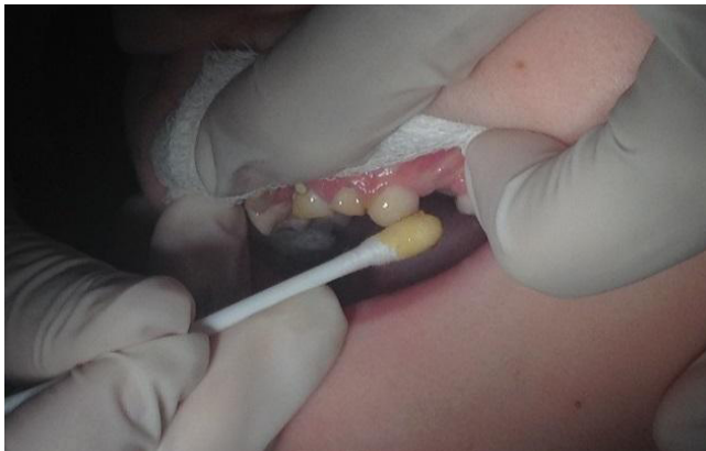
Figure 5 - Fluoride varnish application