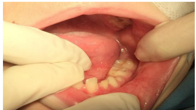
Figure 7 - Initial aspect of left mandibular teeth

After 3 months, the patient was reassessed to control oral health. The mother could not perform oral hygiene and cariogenic diet continued. At clinical examination, some GIC restorations fractured and the child had active white spots on other teeth (figures 6, 7, and 8). Furthermore, the mother reported that the boy should undergo a diet due to overweight.