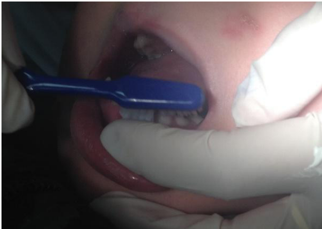
Figure 4 - Tooth brushing