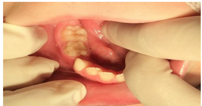
Figure 8 - Initial aspect of right mandibular teeth

Considering that, the treatment planning comprised dental treatment under general anesthesia at a hospital setting through nasal intubation (figure 9) to provide adequate space for dental treatment.