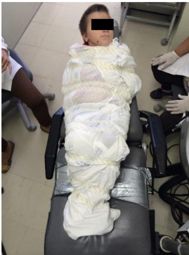
Figure 1 - Physical restraint

After the reading and signing of the Free and Clarified Consent Form, the child was submitted to physical restraint aiming at his safe, and at assuring the treatment quality, due to his non-cooperative behavior (figure 1).