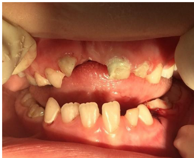
Figure 10 - Final immediate aspect

Tooth #46 received GIC sealant, and teeth #62 (labial), #61 (labial-mesial-palatal), and 85 (lingual) received GIC restorations. Because active white spots were present on teeth #73, #83, and #46, we applied fluoride varnish under dental anesthesia and the subsequent applications would be executed in dental chair. The other teeth also received fluoride varnish (figure 10). The finishing and polishing procedures were executed at outpatient setting.