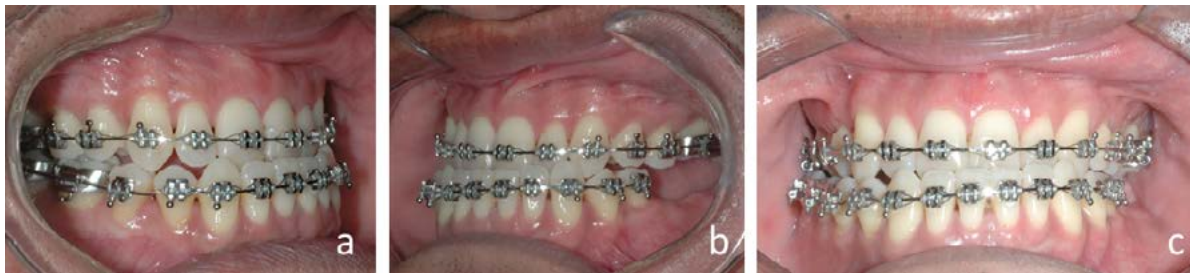
Figure 2 - Intraoral pre-operative images showing a class III occlusion: A) right lateral view from dental occlusion; B) left lateral view from dental occlusion; C) frontal view from dental occlusion, with 3-mm right deviation from the midline of the maxilla