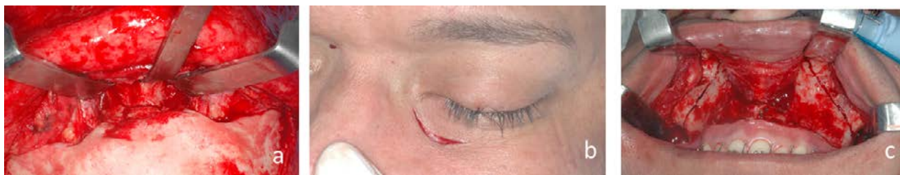
Figure 4 - Surgical procedure: A) bicoronal access; B) lower eyelid access; C) intra oral access to perform Le fort II osteotomy

The surgical procedure was performed under general anesthesia, with nasotracheal intubation. The accesses used were bicoronal, lower eyelid and intraoral (figure 4). The Le Fort II pyramidal osteotomy was performed with a piezoelectric motor (NSK, São Paulo, SP, Brazil) and with a drill (Kavo, São Paulo, SP, Brazil), the nasomaxillary complex was mobilized with Rowe forceps for an advancement of 7 mm. After the maxillary-mandibular block, fixation was performed with plates and screws of the 2.0 system (Orthoface, Curitiba, PR, Brazil) on the zygomatic pillar and in the nasal frontal suture. A titanium screen (Orthoface, Curitiba, PR, Brazil) was placed in the nasal region to improve the contour and to cover the plate and screws.