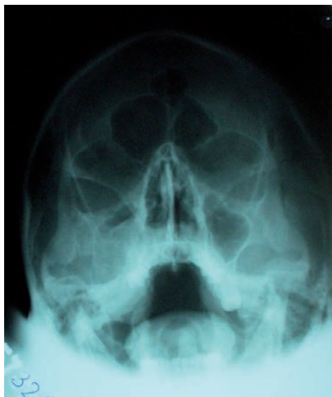
Figure 2 - X-ray PNS (Water's view) showing heterogeneous opacity in the right maxillary sinus

The systemic examination was clinically normal, and routine blood and urine examinations were within normal limits. X-ray showed heterogeneous opacity in the right maxillary sinus (figure 2). CT scan demonstrated ground glass appearance over the right maxilla.