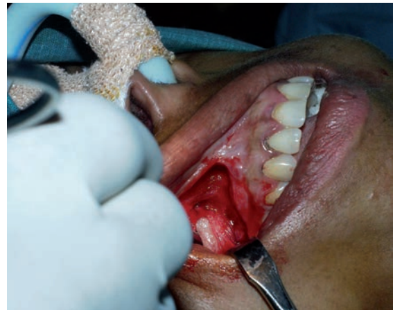
Figure 3 - Excision of lesion via a Caldwell-Luc approach

The lesion was excised via a Caldwell-Luc approach (figure 3). The mass involved the anterior, inferior and lateral wall of the maxilla. It was firm in consistency with gritty sensation. Antral pack was removed on the second post-operative day. Progress after surgery was on expected lines and recovery was complete by the time of discharge on the fifth post-operative day.