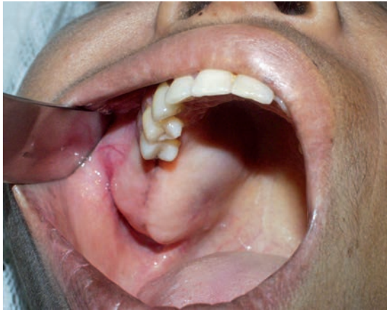
Figure 1 - Clinical photograph of patient showing intraoral swelling involving the right half of the palate and the alveolar margin

The examination showed that there was fullness of the right maxillary region and an intraoral swelling involving the right half of the palate and the alveolar margin (figure 1). The swelling measured about 3x4 cm, extending from 2 cm behind the incisor tooth anteriorly up to the retromolar trigone posteriorly. It extended from the midline medially to the gingivobuccal sulcus laterally. The swelling was tender on palpation and firm in consistency.