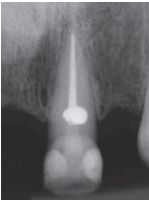
Figure 5 - Radiographic image of the root canal filling showing the root resorption sealed