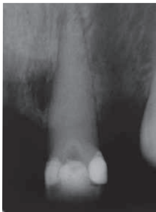
Figure 4 - The root canal was filled with intracanal medication using a calcium hydroxide-based sealer