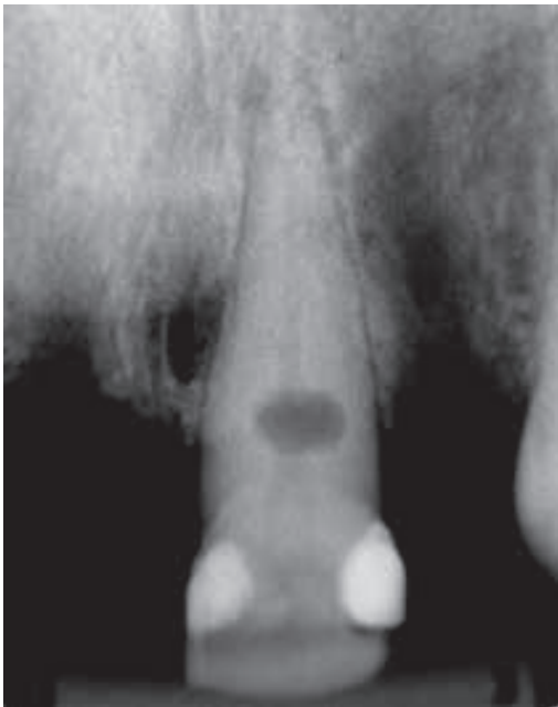
Figure 1 - Initial X-ray showing a radiolucent area indicating internal root resorption at the middle third of the root canal