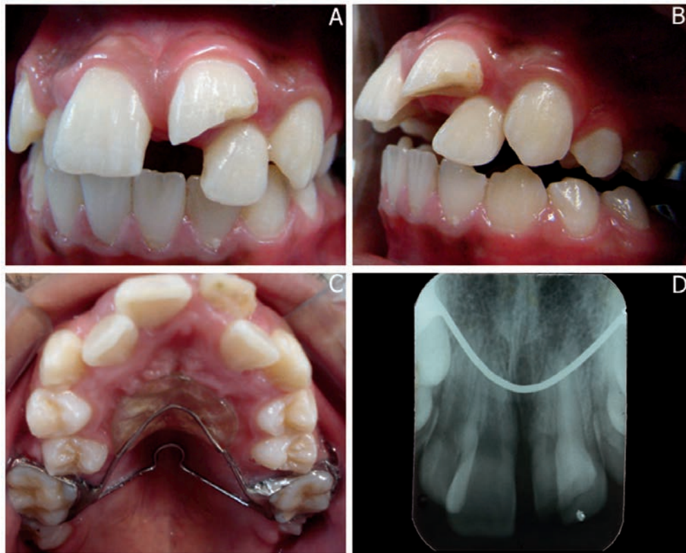
Figure 1 - A) Frontal view of the occlusion. Tooth #21 showing large oblique crown fracture; B) Left lateral view; C) Maxillary occlusal view; D) Periapical radiograph of the central incisors

After the removal of the absolute isolation, the restoration finishing was executed, and the occlusion was adjusted through finishing burs. At the following appointment, the restoration polishing was performed through abrasive discs (Sof-Lex Pop-On, 3M ESPE, St. Paul, MN, USA), abrasive rubber points (Enhance, Dentsply, Petrópolis, RJ, Brazil), felt discs with abrasive paste, and silicon carbonate brush (Astrobrush, Ivoclar Vivadent, Amherst, NY, USA). A smooth, bright surface was obtained and an aesthetic, improved, more harmonious outcome was achieved. The treatment met the patient's expectation. After 18 months of following-up, the tooth is asymptomatic and the patient is undergoing orthodontic treatment.